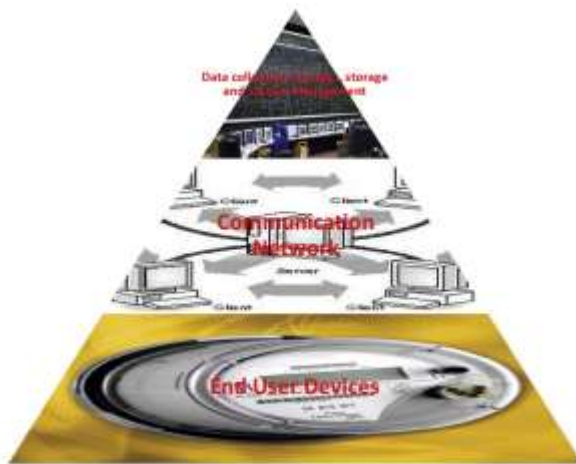
Fig. 2. Schematic representation of AMI.

The data is then sent to a meter data management system (MDMS), which handles data storage and processing before delivering the results to the utility service provider. Since AMI allows for two-way communication, the utility may also provide commands or price signals to the meter or load regulating devices [5].